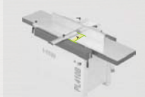
Key Capacity A Max Planer Width 410mm