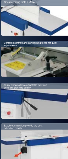
Fine machining table surface

The PL410B features a total length of over 2 Meters. The heavy cast-iron tables are supported by parallelogram adjusters and easy controlled Levers. The fence is a heavy profile with centered controls and cam locking for quick and repeatable accuracy. The front control panel allows for quick, easy operation.