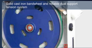
Solid cast iron bandwheel and reliable dual support tension system

BS510B is perfect for the smaller shop that has serious ripping requirement. Standard features such as industrial blade guides on the top/bottom, Quick blade tension with indicator, Easy drift fence and gear driving tilting table and so much more! It puts industrial style features and very capacities within reach of the discerning woodworker who needs rock solid performance and reliability.