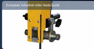
European industrial roller blade guide