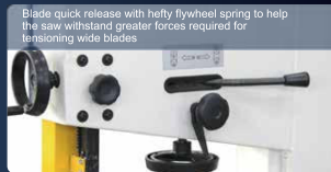
Blade quick release with hefty flywheel spring to help the saw withstand greater forces required for tensioning wide blades