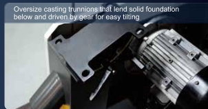
Oversize casting trunnions that lend solid foundation below and driven by gear for easy tilting