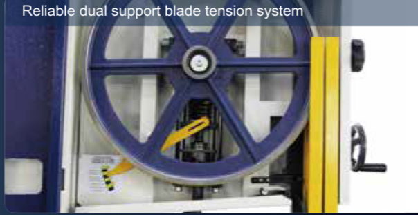
Reliable dual support blade tension system

The 18" Bandsaw has become increasingly popular as greater ripping widths and increased power are needed for handling larger sized lumber, panels or timbers used in cabinetmaking, carpentry and other trades. BS450E is an entry level machine to this larger capacity category.