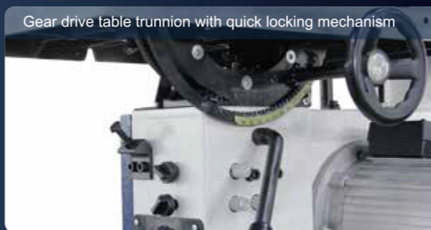
Gear drive table trunnion with quick locking mechanism