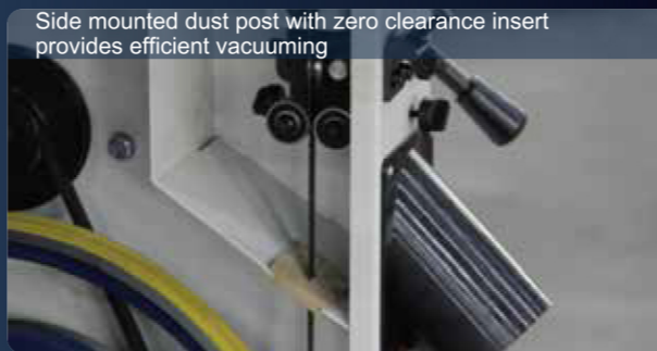
Side mounted dust post with zero clearance insert provides efficient vacuuming