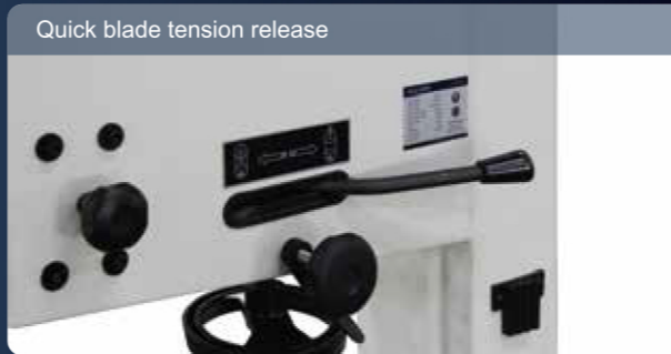
Quick blade tension release