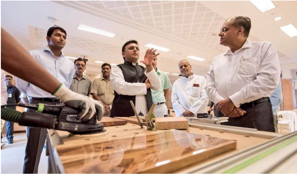
Hon'ble CM Sh Akhilesh Yadav