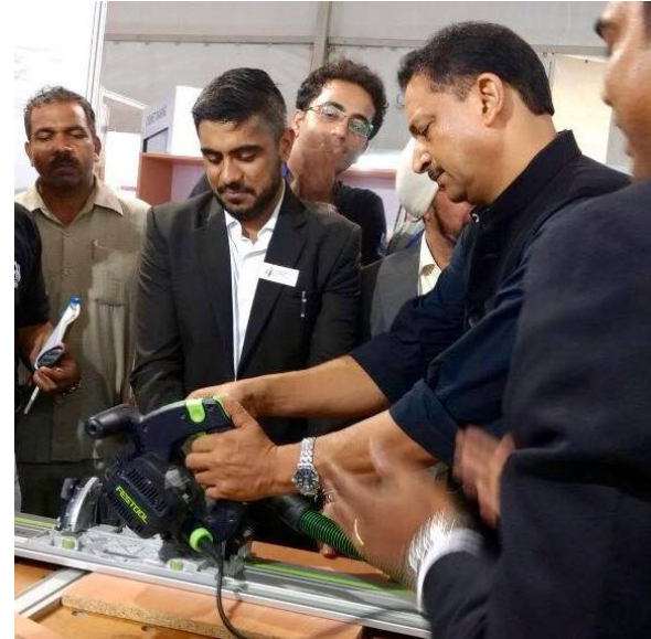
Hon'ble Skill Minister Sh Rajiv Pratap Rudy