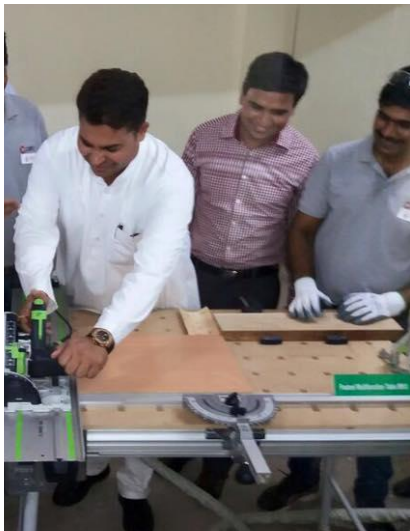
Hon'ble Skill Minister of UP Sh Abhishek Mishra