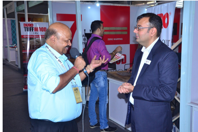
ABID Aug 2016