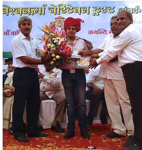
Honoured by Suthar Samaj at Mumbai