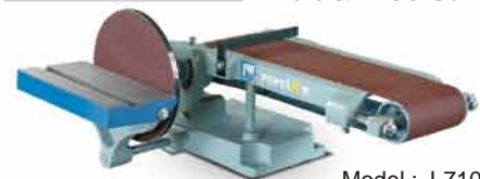
Model : J-710