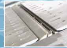
Noise dampening system for quieter operation