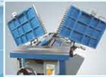
With unique folding-top facility for flexibility