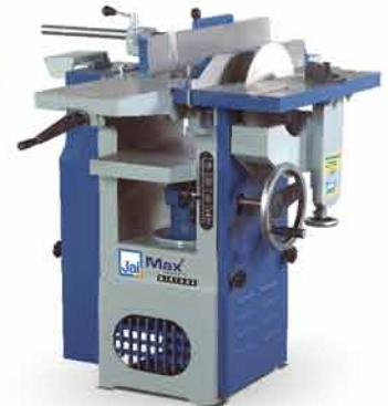
Model : J-1010