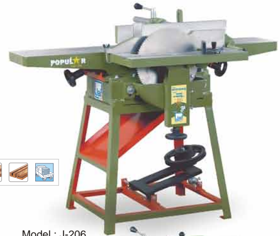
Model : J-206

STANDARD ACCESSORIES :- 2 planer blades fitted in cutter block, mitre gauge, motor pulley, motor fixing plate, toolkit & m/c manual. * L = Machine with 61" table length. / * LL = Machine with 72" table length