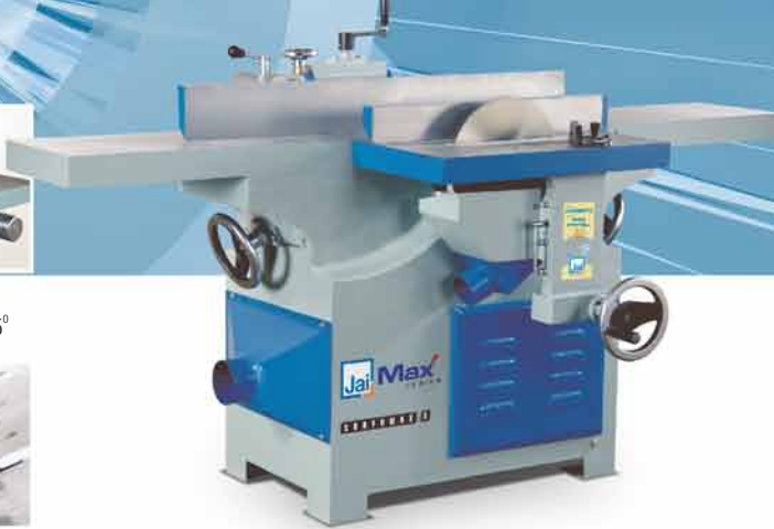
Model : J-3013

Noise dampening system for a quieter operation