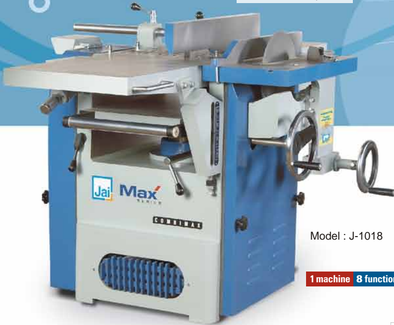
Model : J-1018