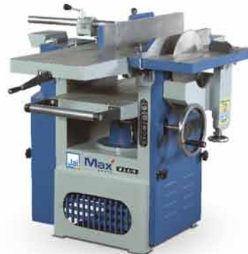
Model : J-1015