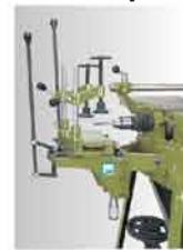
PDP (W/o Drill chuck & drilling tool)

It is optional, can be ordered any time separately