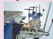
Standard Accessories : 3/4" Drill Chuck, Drilling Tool