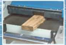
Anti kick-back system to avoid backsliding