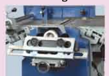
Standard Accessories : Emery Cup Wheel (4" dia.)