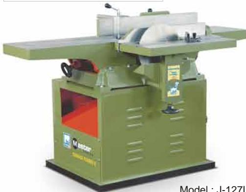
Model : J-127L