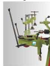
PD (Gear Type) (With 1/2" Drill chuck & drilling tool)