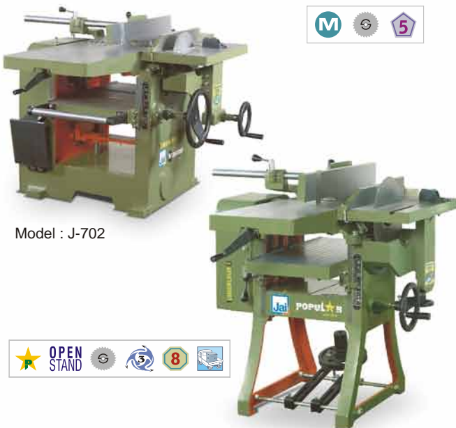
Model : J-702