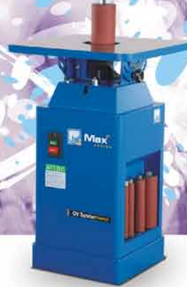
Model : J-82 OVS

STANDARD ACCESSORIES :- 1 no. electric motor 0.5 HP/1440 RPM (1-phase) table inserts, special switch, toolkit & m/c manual.