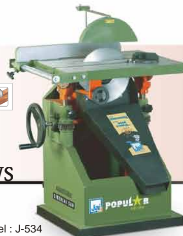
Model : J-534