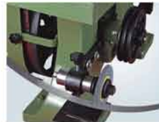
Blade grinding attachment