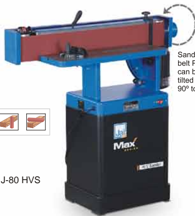
Model : J-80 HVS