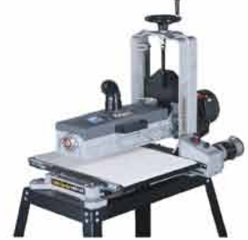
Model : J-1632