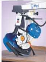
Model : J-925 (A)