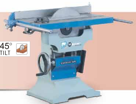
Model : J-535 (H)