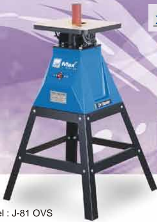
Model : J-81 OVS