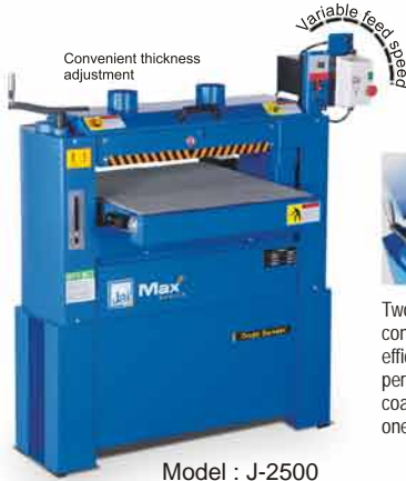
Model : J-2500