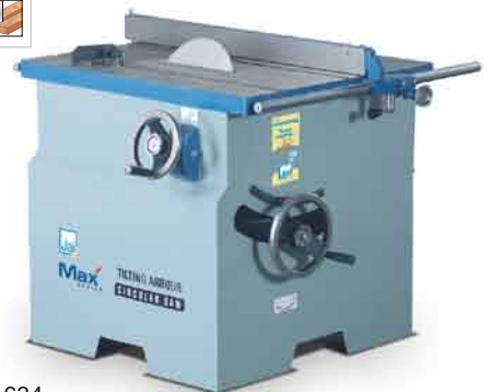
Model : J-634