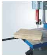
Circular cutting attachment