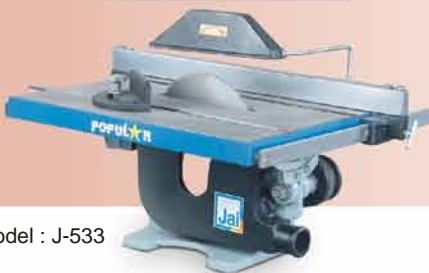
Model : J-533