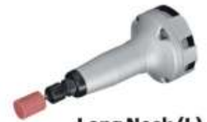
Long Neck (L)