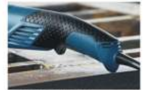
Long handle (H)