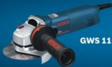
GWS 11-125 CIE