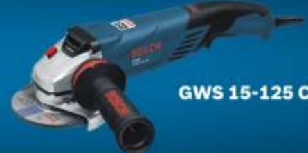
GWS 15-125 CIH