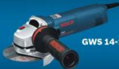
GWS 14-125 CI