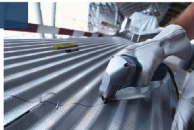
The handy tools for cutting application